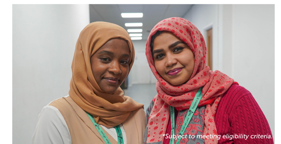
*Subject to meeting eligibility criteria.

ESOL classes for adults whose first language isn't English. They provide the opportunity to improve speaking, listening, reading and writing skills, and gain a nationally recognised English qualification.